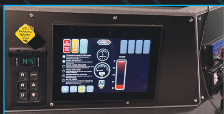
10" LCD touch-screen, wide-view display

User-friendly, modern, automotive-style screens put information and control at your fingertips.