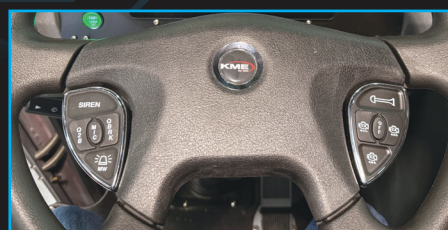
Smart Wheel controls