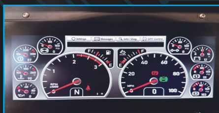
Digital dash display